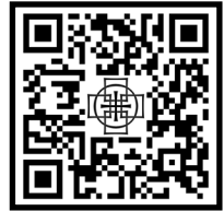
NemoVote Log In