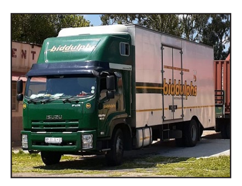
The arrival of the 20' shipping container that carried our books and belongings to South Africa

possessions are worth more to us than all the gold in the world.