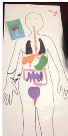
The Universal Human starting to take shape.

The heart is the community of celestial angels tasked with taking the goodness of new spirits and delivering them to the communities most in need of their use and service. I explained how in heaven, the circulatory system is all about spreading love and the respiratory system is concerned