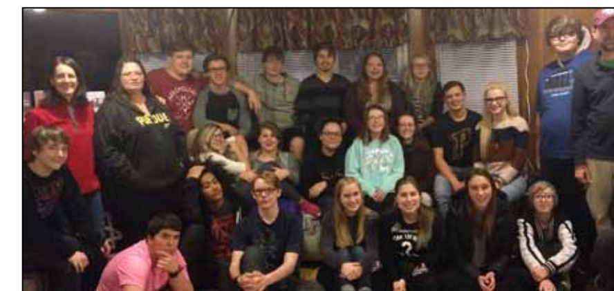
Twenty-two teens gathered for the Almont Winter Retreat

about our personal lives, and through every screen shot, every press of the share button, we are spreading these ideas and lessons and mistakes to our friends and family and loved ones. Those share buttons are a form of modern oral tradition.