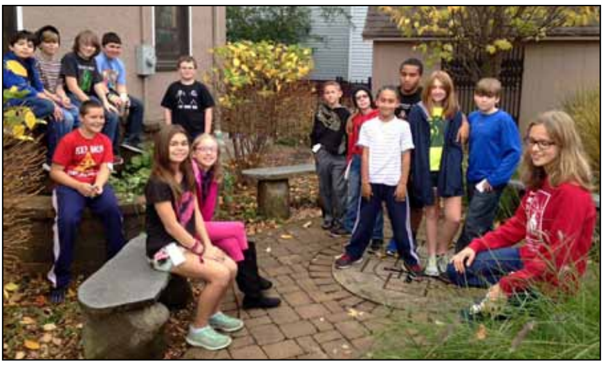
The SPLATz retreat group takes a break in the LaPorte New Church garden.

ferent it was from what we now know about outer space. We then discussed some scientific facts about our own solar system and galaxy, and the distant stars. I was thoroughly impressed by how much these young children knew about the sun, moon, and stars. One child even brought up