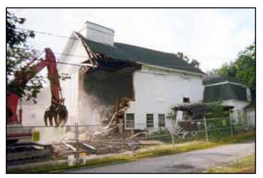
The new Elmwood New Church will rise phoenix-like from the "ashes" of the old.

In usual fashion, the building permits were delayed for over a year due to administrative issues, but finally granted in the middle of October. The architect and the contractor have worked extremely well together, and the site work and foundations are now going into the ground so that the structure can be erected "tight to the weather"