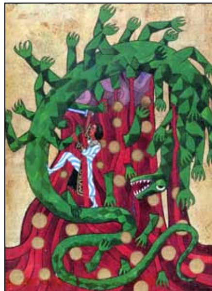
The inner hero slays the dragon representing the regressive tendencies of the psyche (The Red Book).

Both Swedenborg and Jung credit the positive feminine figures in their dreams as being the source of wisdom and instructors of souls. While feminine figures may have elements eliciting anxiety, as for example in Swedenborg's well-known vagina dentata (vagina with teeth) dream, the break-