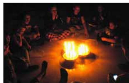
Campfire on the altar

The retreat was a success from everyone's point of view. The youth learned