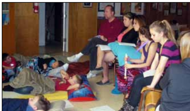
Watching video about Jesus in the Bible

Love?" (hip-hop). In response to the lyric, "Father, Father, Father help us," one youth asked, "Is Jesus the same person as God?" When we listened to the gospel song, "I'll Fly Away," several youth spread their arms and flew around the room. Participants listened respectfully to the Kyrie of Beethoven's "Mass in C," but thought it a little long. Nevertheless, I felt that Beethoven captivated and moved them at first.