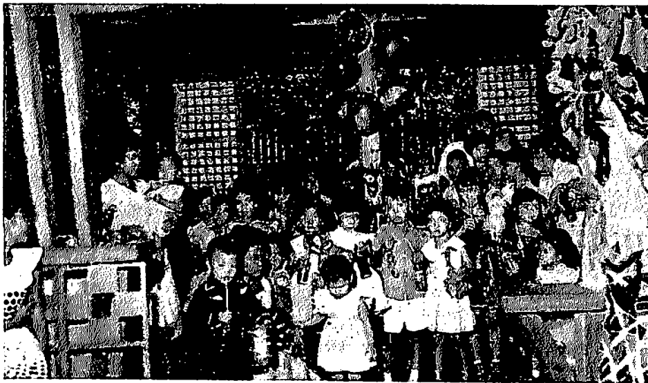
Children in Malabon, Philippines receiving Gifts from New Church Friends in America.