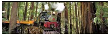
The steam train through the redwoods