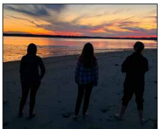
Leaguers appreciate a sunset over Kingston Bay.