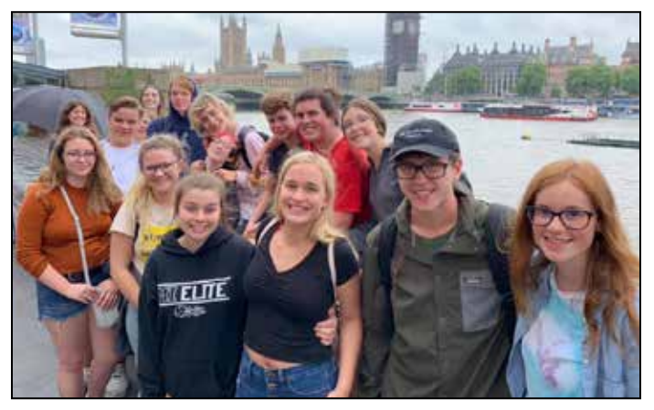
SCYL teens on the banks of the Thames, with the Big Ben tower and Westminster Hall in the background