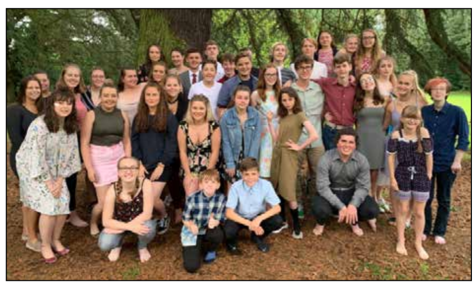
The Swedenborgian International Summer Camp (ISC) Teens

As tired as we were, our tour of London was fantastic. We traversed London by train, Underground (Tube), Thames River taxi, classic red double decker bus, and often, Shanks' Pony (which is walking, one of the many British idioms we learned on our trip). We soaked up as many sights and as much culture as we could during our