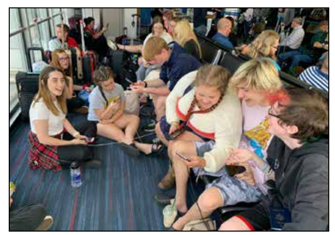
SCYL teens gather at the gate to board our flight to London.

epic city. Open-air Borough Market was a sensorial delight with its many sizzlingly pungent food booths, Continues on page 124