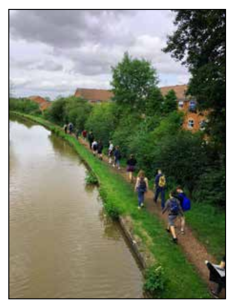
The teens stroll alongside Coventry Canal on their outing to the nearby village of Atherstone.

We enjoyed a Tuesday morning wooded walk to the nearby town