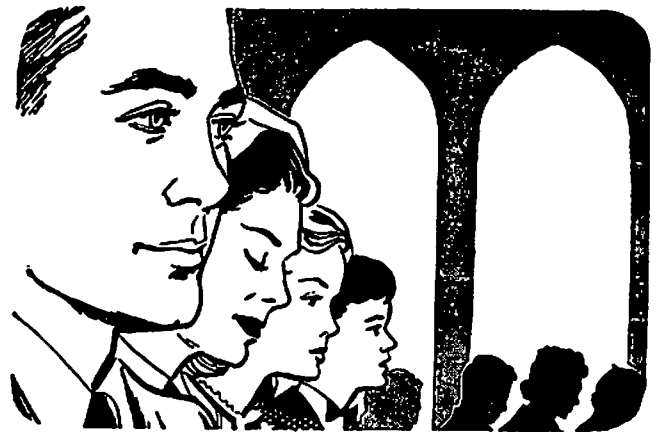
RELIGION IN AMERICAN LIFE PROGRAM