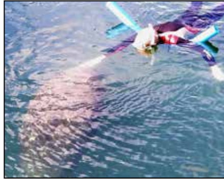
A manatee greets the editor

It is amazing that Christians can have such opposite interpretations of God's giving dominion over the natural world to humankind. Some say it means we are to exploit it for our purposes of survival, progress, and comfort while others hold that it means we are the caretakers of the world, charged with the responsibility of protecting,