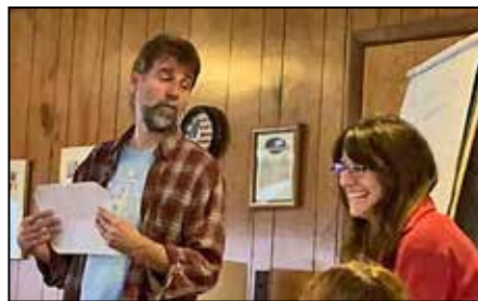
"Wait. What did you say?"

equality-, and gender-based questions. She closed her session by having us write down a message that we might hear that separates us from our neigh-