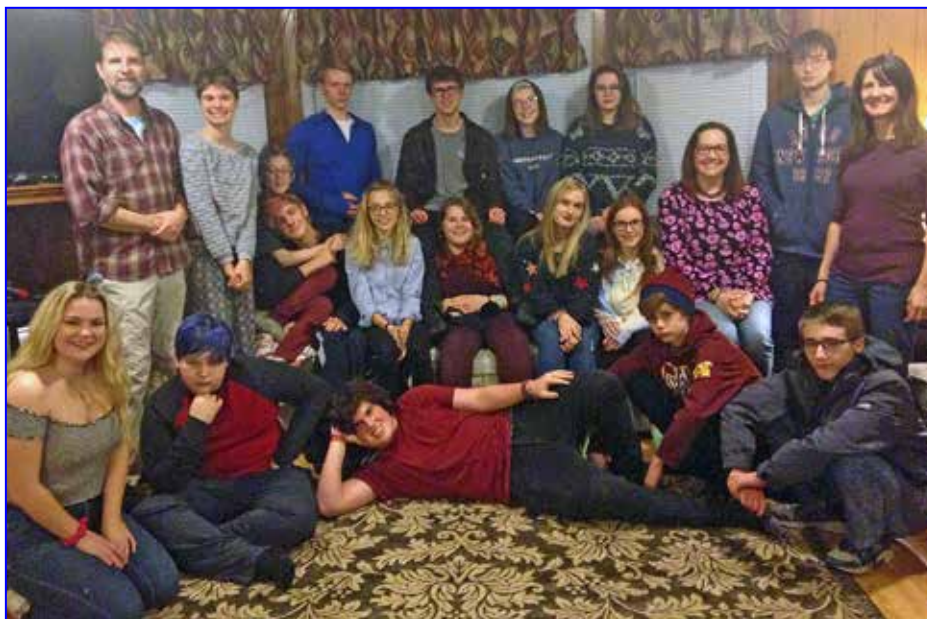
The 2018 SCYL Winter Retreat group

I presented the next session titled Swedenborg