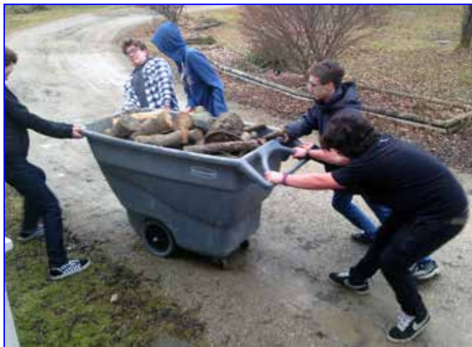
The teen boys haul wood for the closing worship ceremony fire.

ence." In Harry Potter and the Sorcerer's Stone , Professor Dumbledore proclaims to Harry, "To the well-organized mind, death is but the next great adventure." Like Swedenborg, J. K. Rowling depicts individuals in the afterlife as appearing the same as on earth, with the same memories, thoughts, and feelings. I did a similar comparison with correspondence, relating it to Native American tradition and