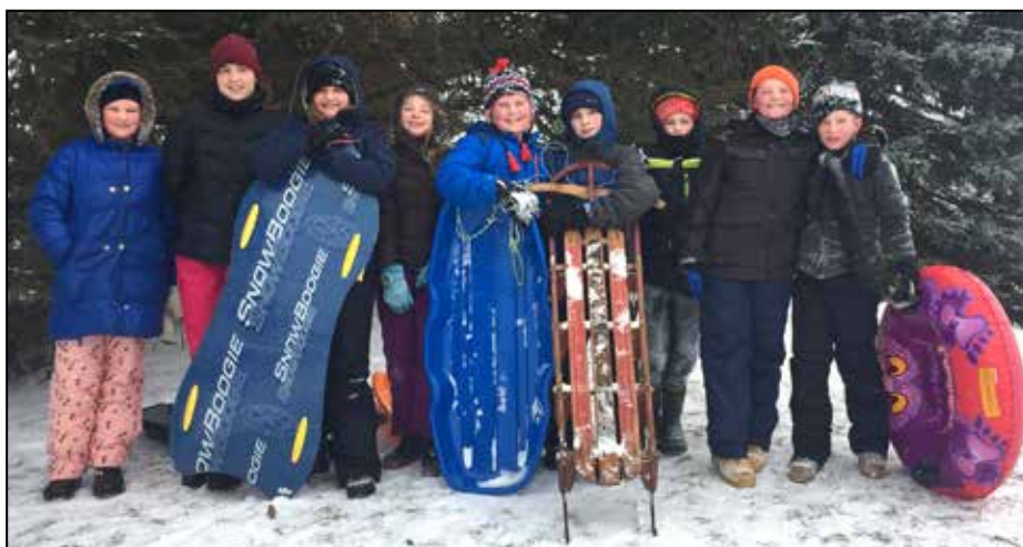
Splat group on the slopes

of creation with the young people, we discovered together that,